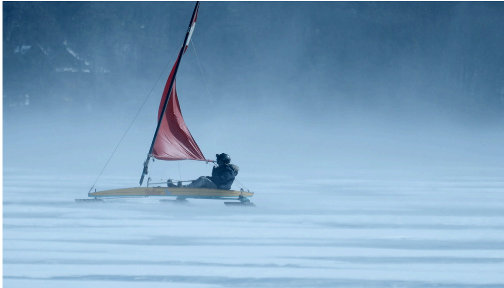
Iceboating, Rovaniemi, Finland, March 2024